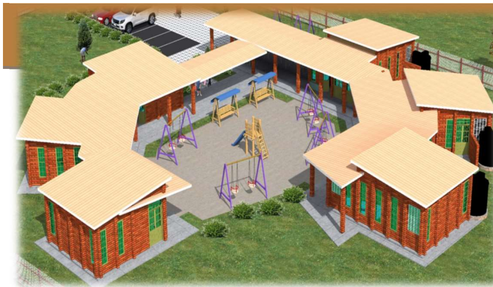
Early Childhood Development (ECD)