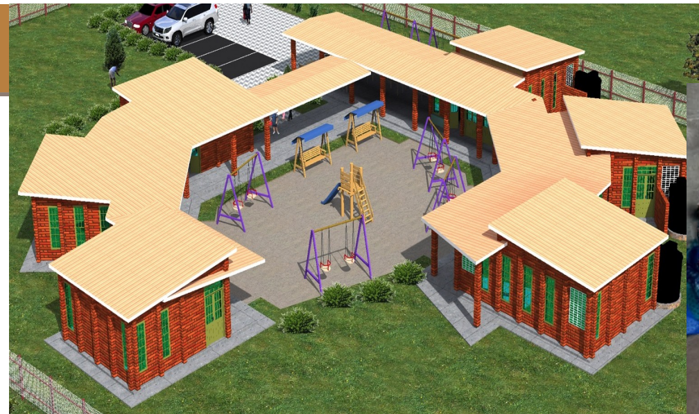
Early Childhood Development (ECD)