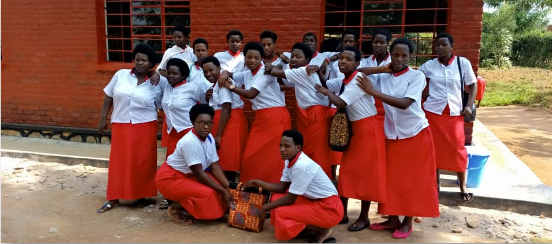
Rilima Women empowerment center